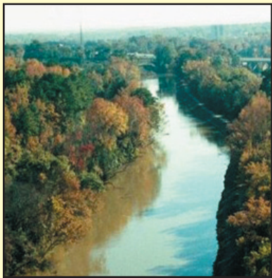
Richland County is bordered by the Saluda, Broad, Congaree and Wateree Rivers.

In an effort to protect our natural and historic resources so that they may be passed down to future generations, Richland County Council created the Richland County Conservation Commission in 1998.