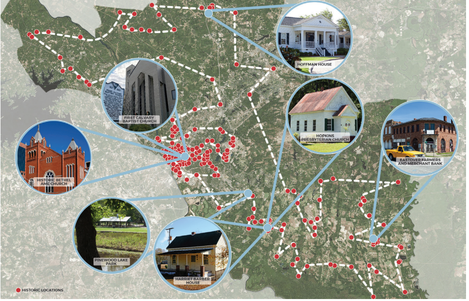
Richland County Historic Trail